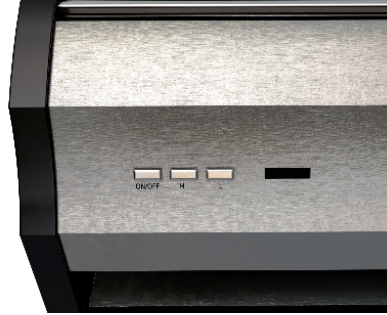
Commands are replicated on board